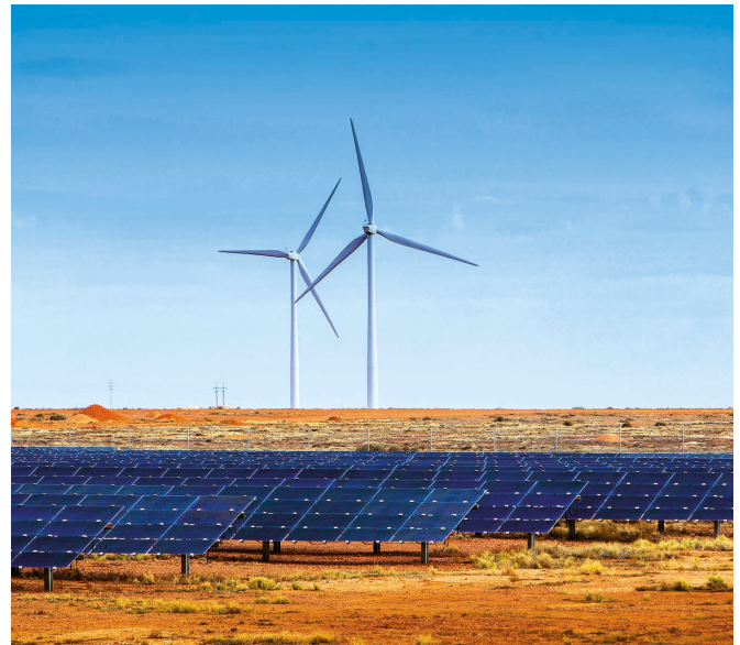
Coober Pedy solar and wind farm

EDL owns and operates a global portfolio of power stations in Australia, North America and Europe.