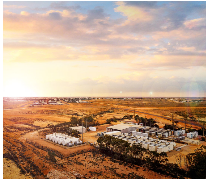
Coober Pedy Power Station

Facilitated by the Coober Pedy District Council, this Fund provides support for community events and activities in the Coober-Pedy township and demonstrates the continued strength of the partnership between Council and EDL.