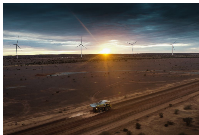
The Agnew Hybrid Renewable Microgrid comprises wind, solar, gas and diesel generation and battery storage.