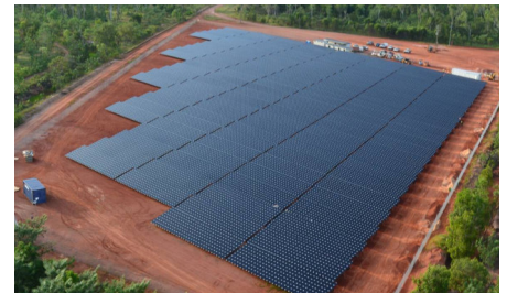
Weipa Solar Farm