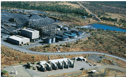
McArthur River Mine Power Station