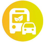
Renewable natural gas