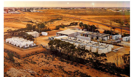
Coober Pedy Hybrid Renewable Project