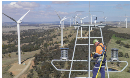
Cullerin Range Wind Farm