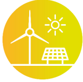
Renewables & hybrids