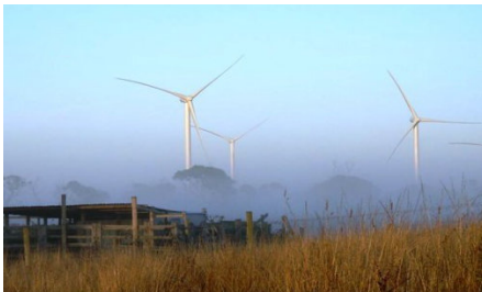
Wonthaggi Wind Farm