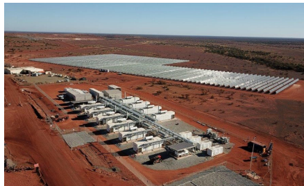
Agnew Hybrid Renewable Project