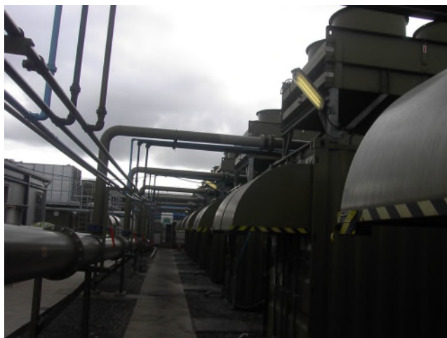
Rainham Landfill Gas Power Station

The site is expected to produce LFG for electricity generation beyond 2030.