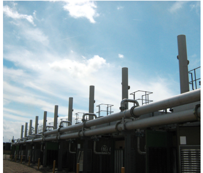
Pitsea Landfill Gas Power Station

Now a renowned wildlife reserve, Pitsea boasts wetland habitats for birds, bee colonies and one of the largest fox habitats in the country.