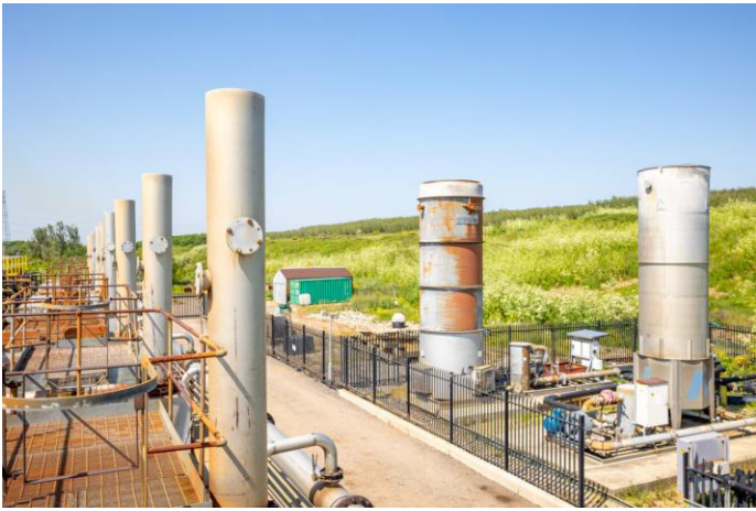
Pitsea Landfill Gas Power Station

EDL owns and operates a global portfolio of power stations in Australia, North America and Europe.